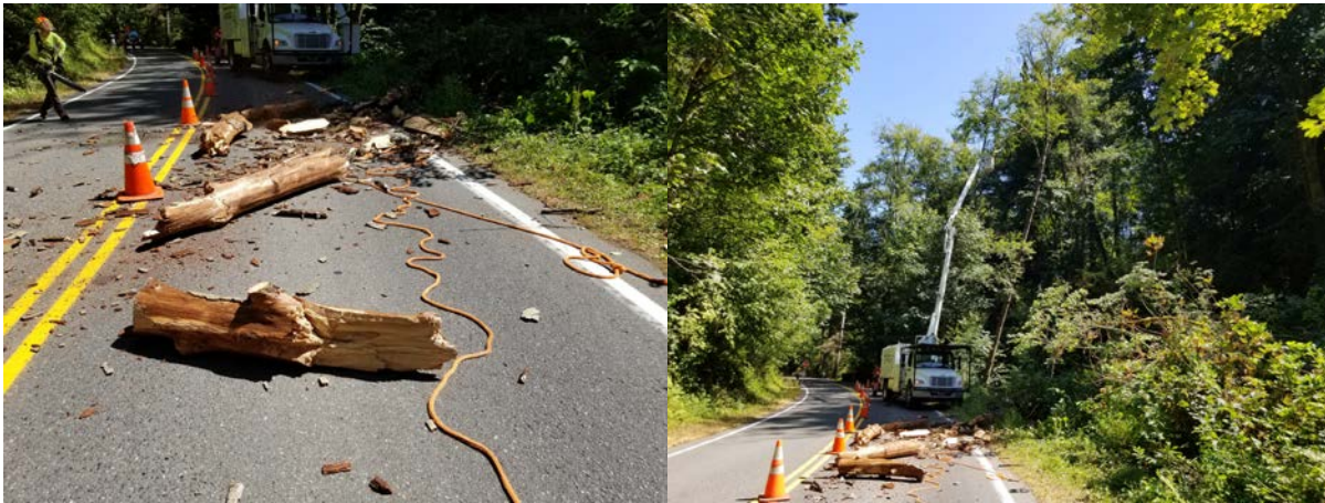
Dead Alder tree split and fell on NE 180 th St, removal of debris and additional dead tree limbs for public safety.