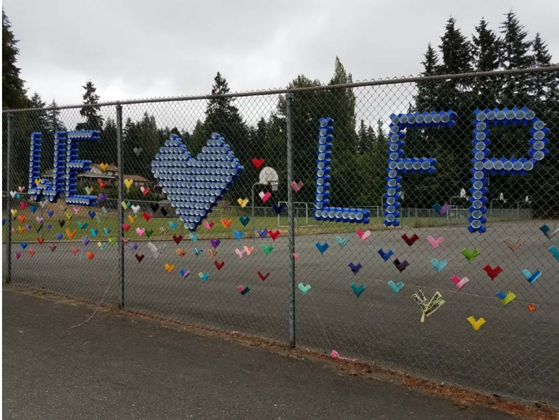
Fun use of blue cups at the LFP Elementary School – unknown artist.