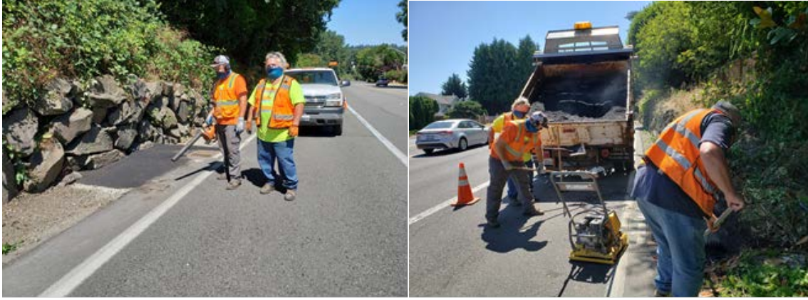
Public Works team repairing and adding asphalt to the surface-water berms on SR-522 for better control of the water sheet flow.