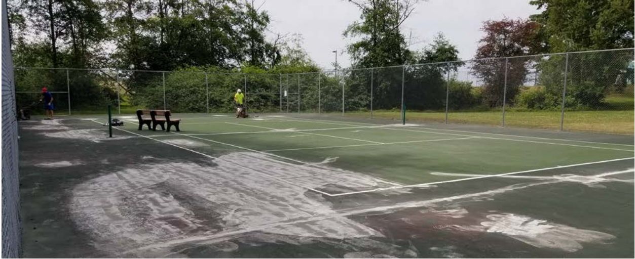
Filling voids and leveling depressions.