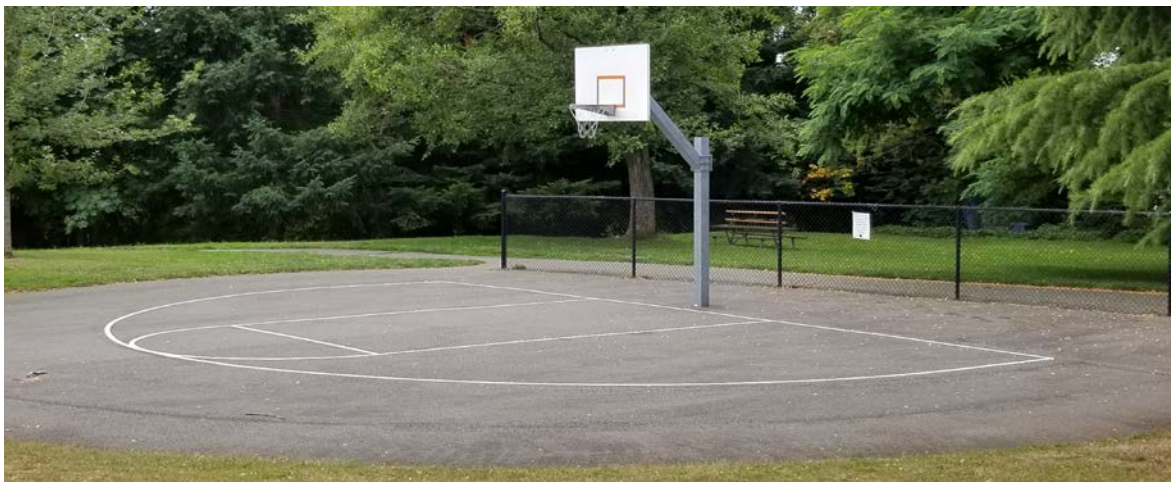
Basketball court restriped using YASG funding from King County (July 2019).