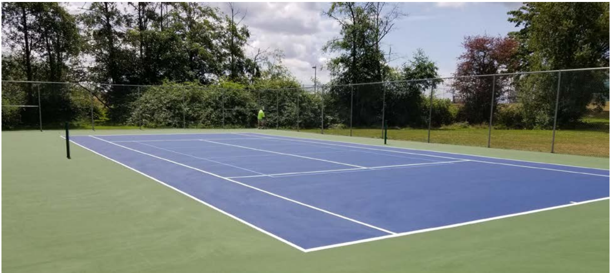
(After) The Tennis court now includes court lines (light blue) to play Pickleball as well!