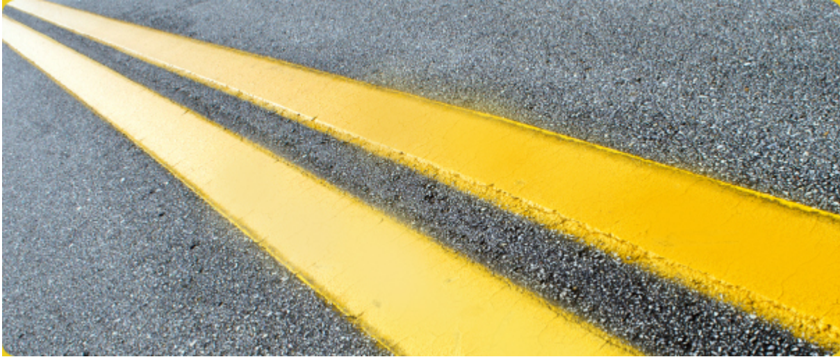
Street striping occurred the Week of July 22