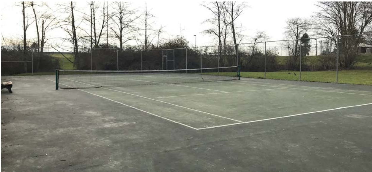
King County's Youth Amateur Sports Grant (YASG) funded the restoration of the Tennis court and striping of the Basketball court at Horizon View Park. (Before)