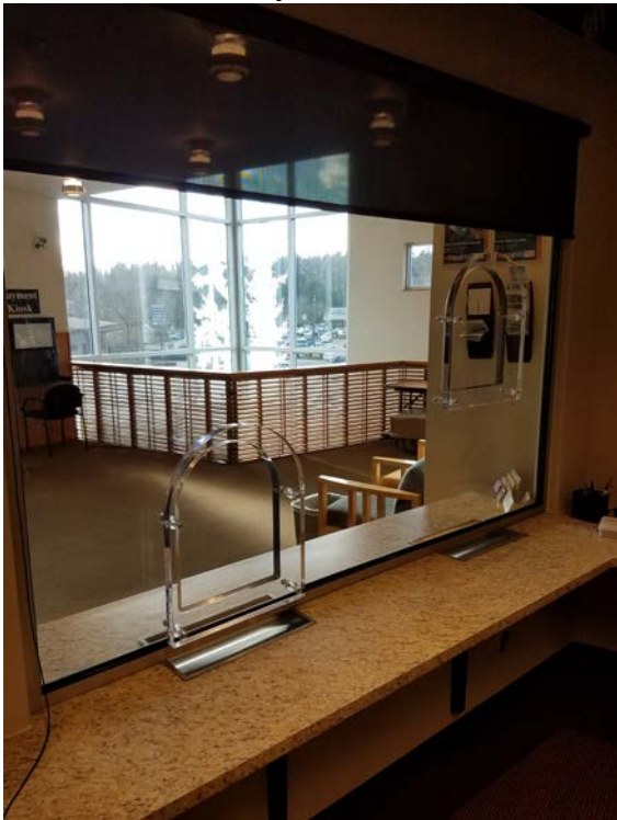
New Bullet resistant glass installed at the LFP Court Front counter area.