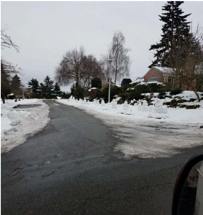
If you look closely, there are between 15 and 20 Snow People and Snow dogs watching the snowfall.