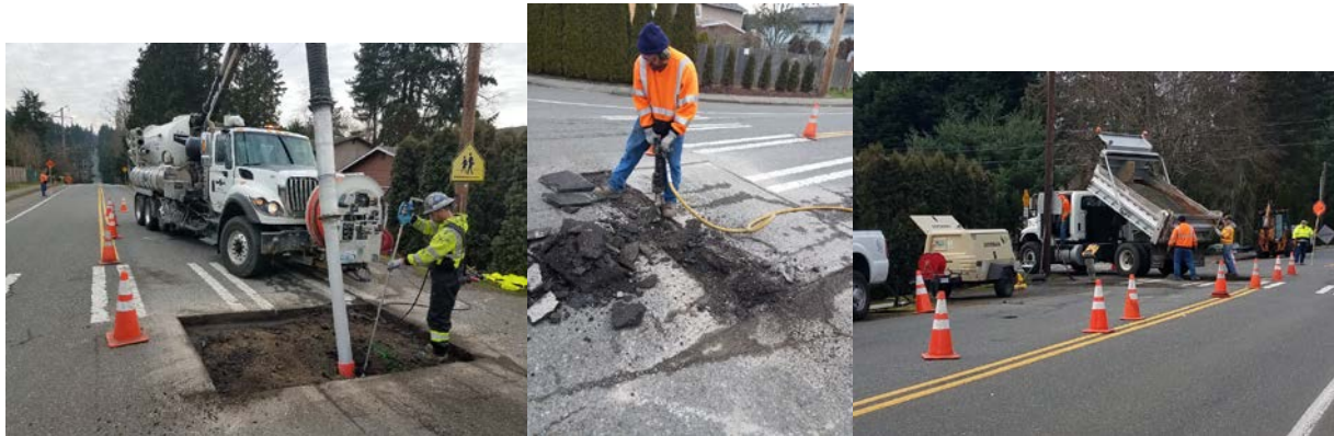
Public Works team repairing a sinkhole that under further investigation discovered a large decaying stump under the road base. It takes a full team to perform this type of repair and to keep the work zone safe.