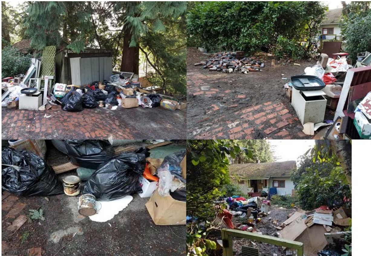
Code Enforcement is working on a violation in the 5000 block of NE 178 th St. Our Building Official is leading the effort with assistance from the City Attorney's Office.