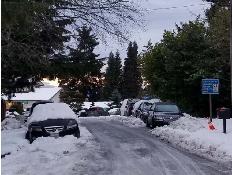
Very hard for the plow to drive in the areas where vehicles park on both side of the street.