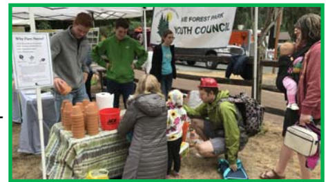
Picnic in the Park 2017

tember 8, from 10:00 a.m. to 4:00 p.m. I've also scheduled two Coffee with the Mayor events for fall. The first is just prior to